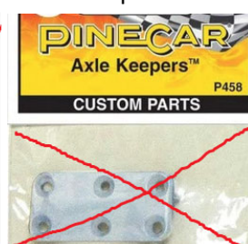
No axle guards/keepers