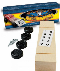
BSA Pinewood Derby Car Kit

(uncut block of wood, 4 axles (nails), and 4 wheels)