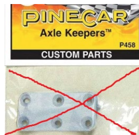
No axle guards/keepers

With the exception of decorative items, weights, glue, lubricants and finishing materials, only Official Pinewood Derby materials noted above may be used.