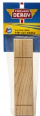
BSA Pinewood Derby Car Kit (precut wood, only) https://www.scoutshop.org/pinewood-derby-pre-cut-wedge-kit-656989.html