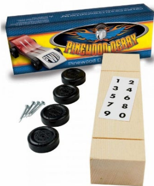
BSA Pinewood Derby Car Kit (uncut block of wood, nails (axles), and four wheels) https://www.scoutshop.org/official-pinewood-derby-car-kit-17006.html

All cars entered must be built using Official Pinewood Derby materials as sold by the BSA. Materials include: